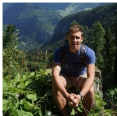
Edward Owens School of History and Heritage