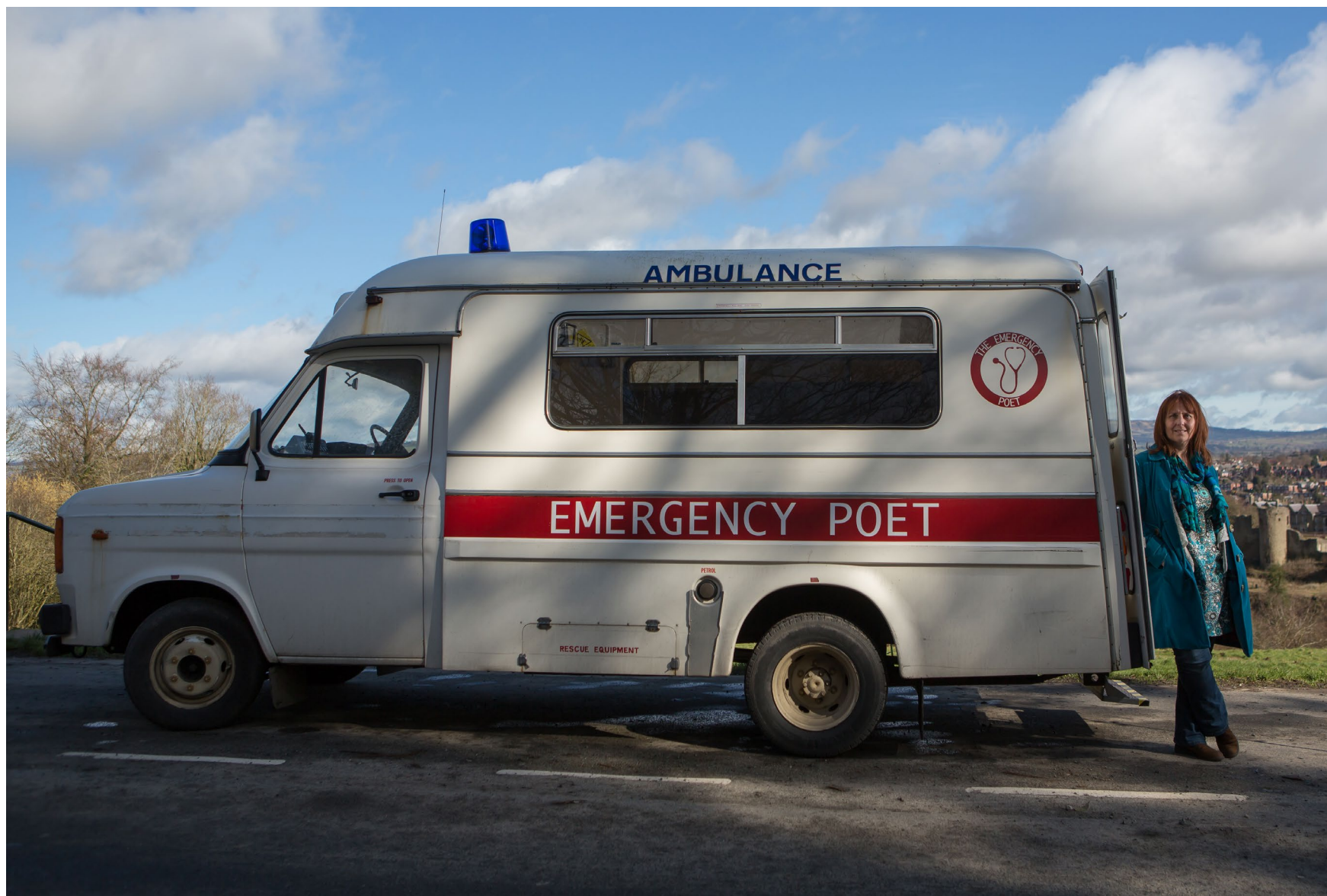
⤴ Poetry on prescription: the Emergency Poet