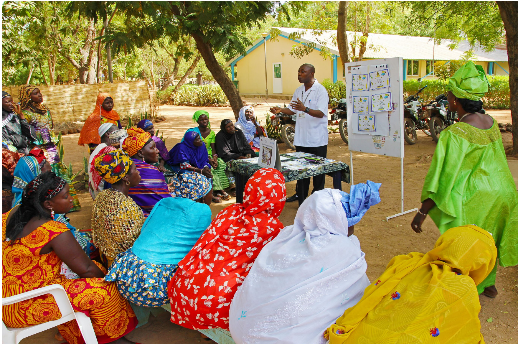
⤴ Keneba Open Day: The first of its kind