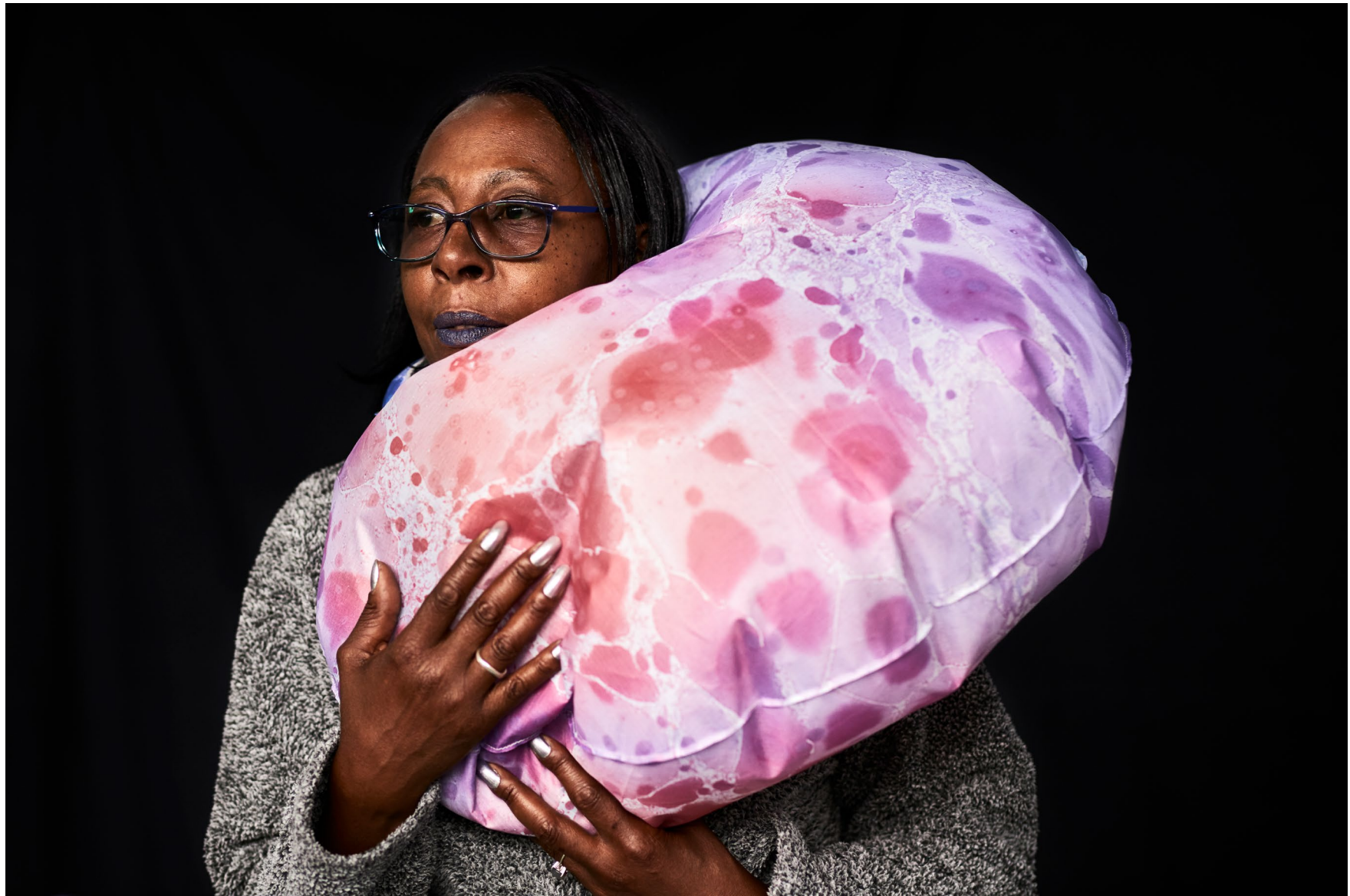
^ Breathing Blue