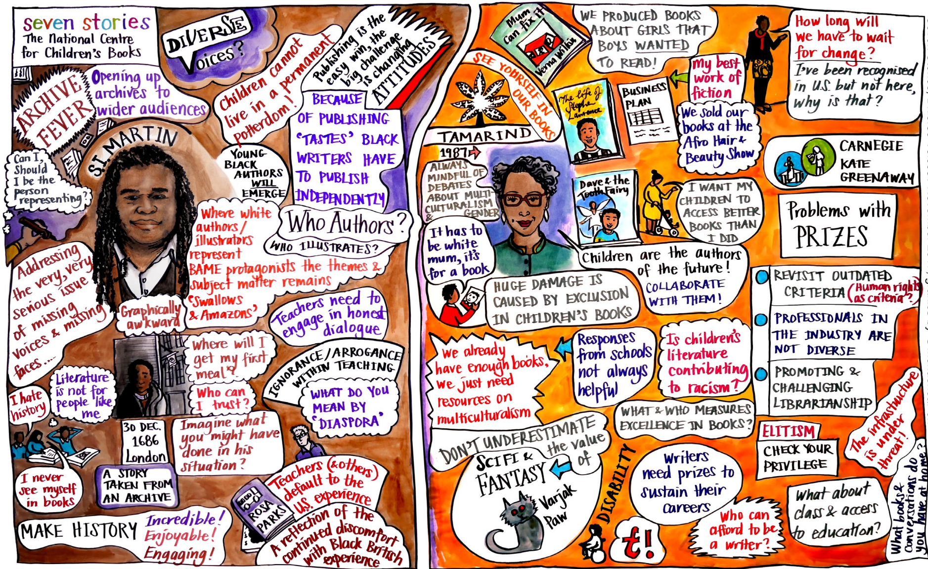
Seven Stories, Diverse Voices? November 2017, graphics by @MendoncaPen