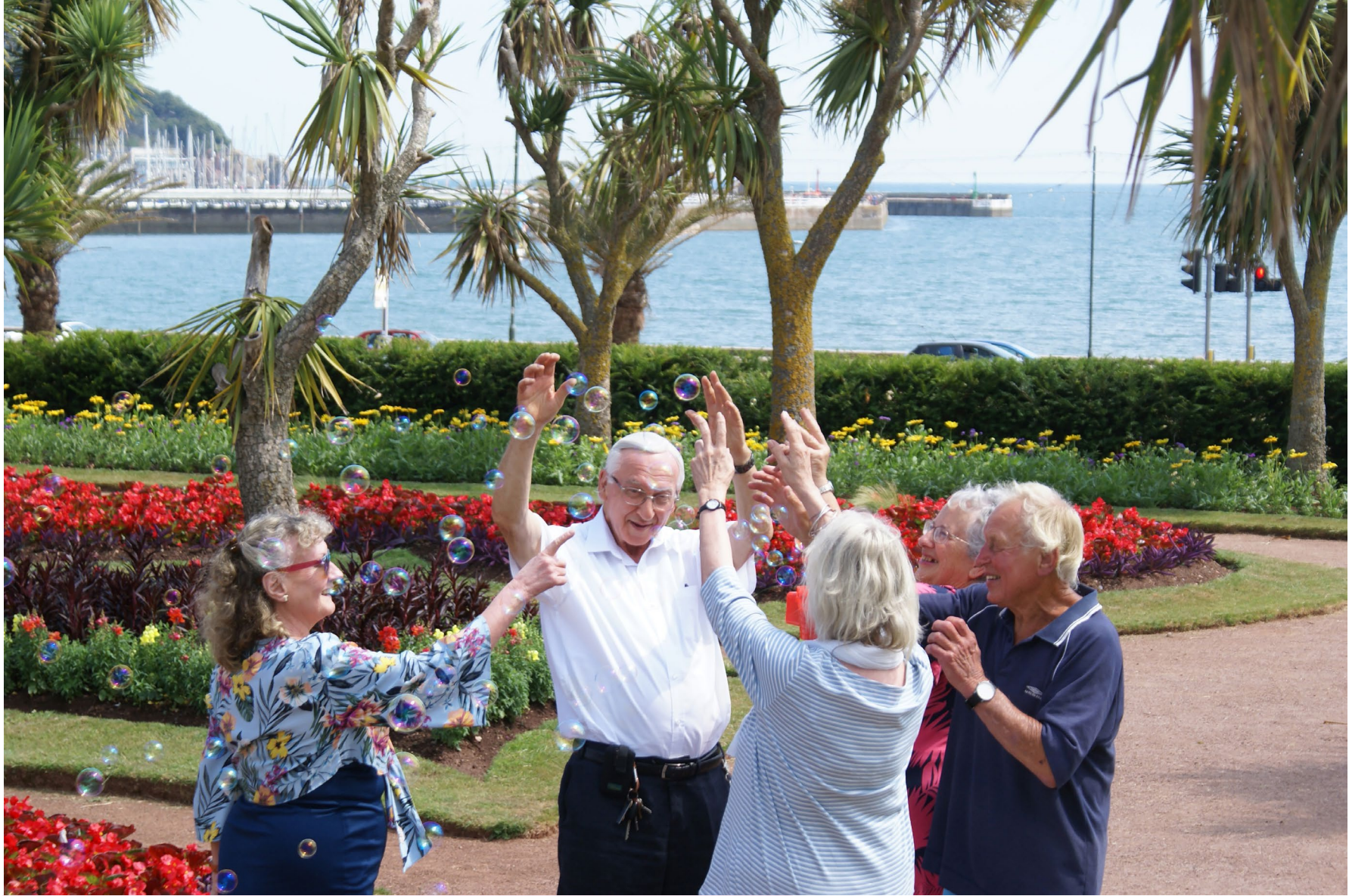
⤴ Citizen Evaluators: Bursting bubbles in research