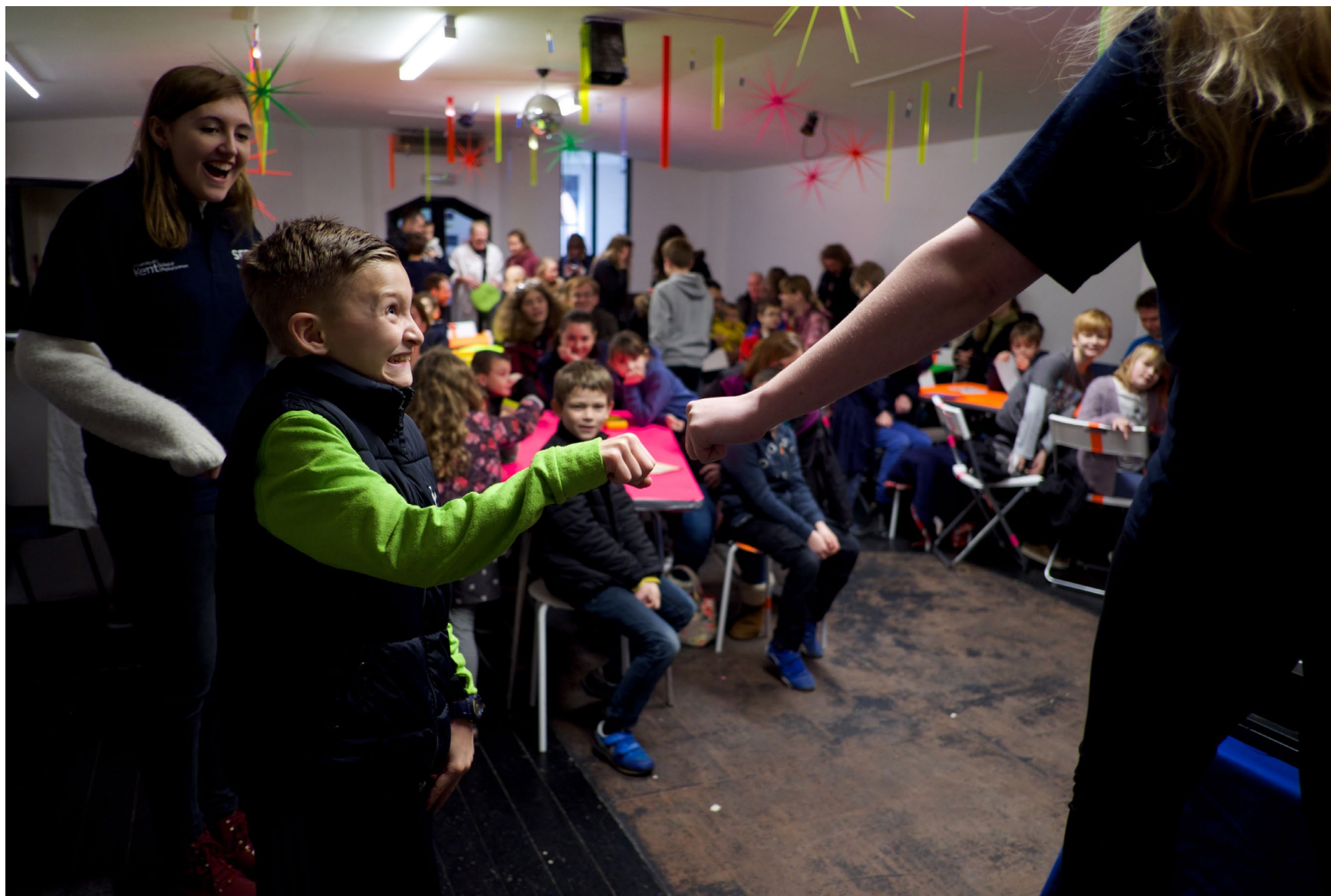
Science and community: sparking connections