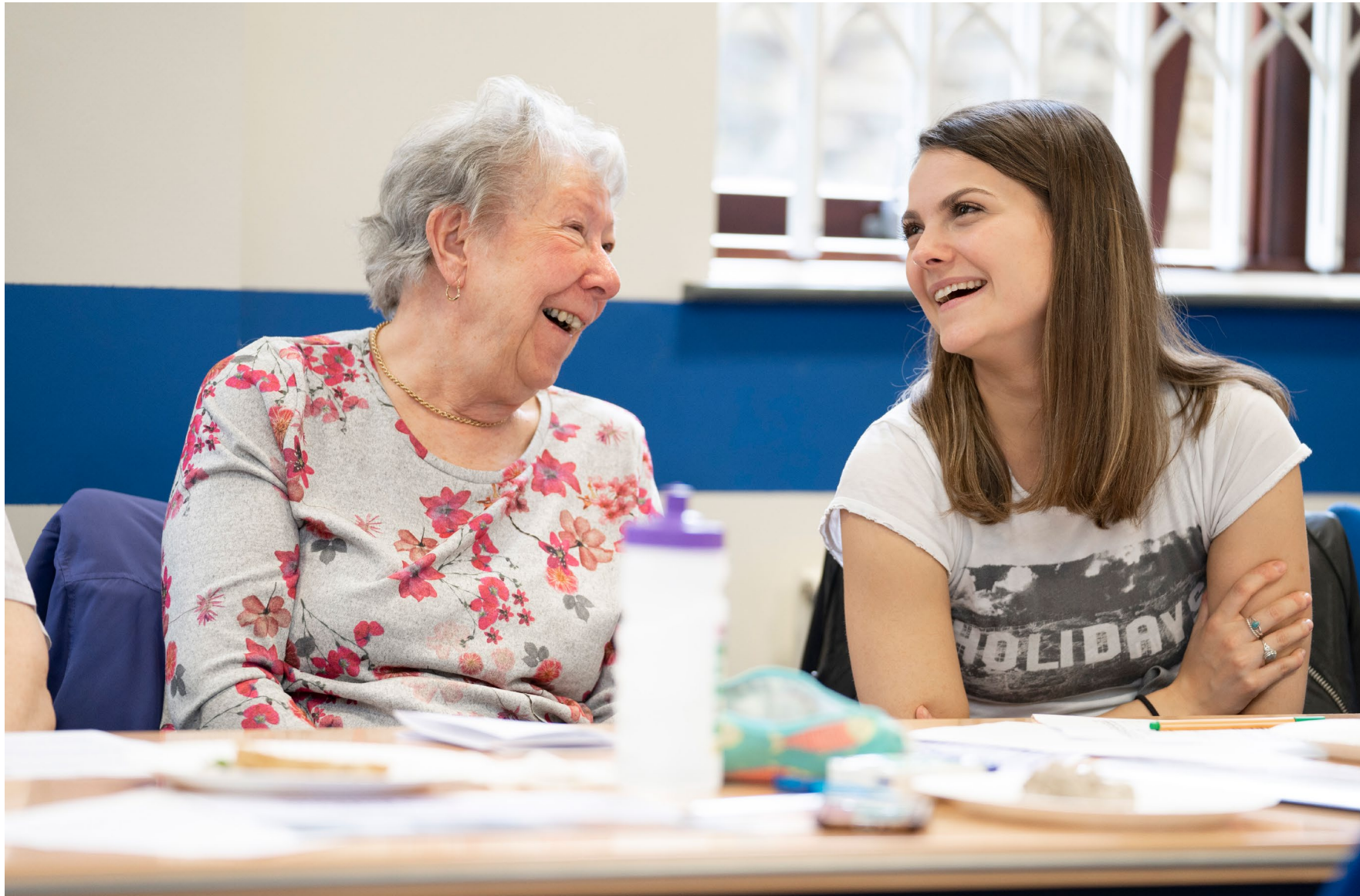
👤 Intergenerational Pen Pals Celebrate Together