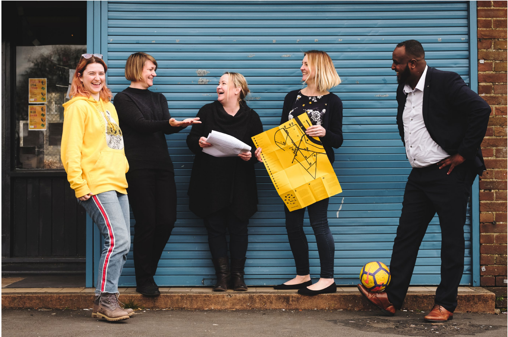
⤴ The Community Gateway Team